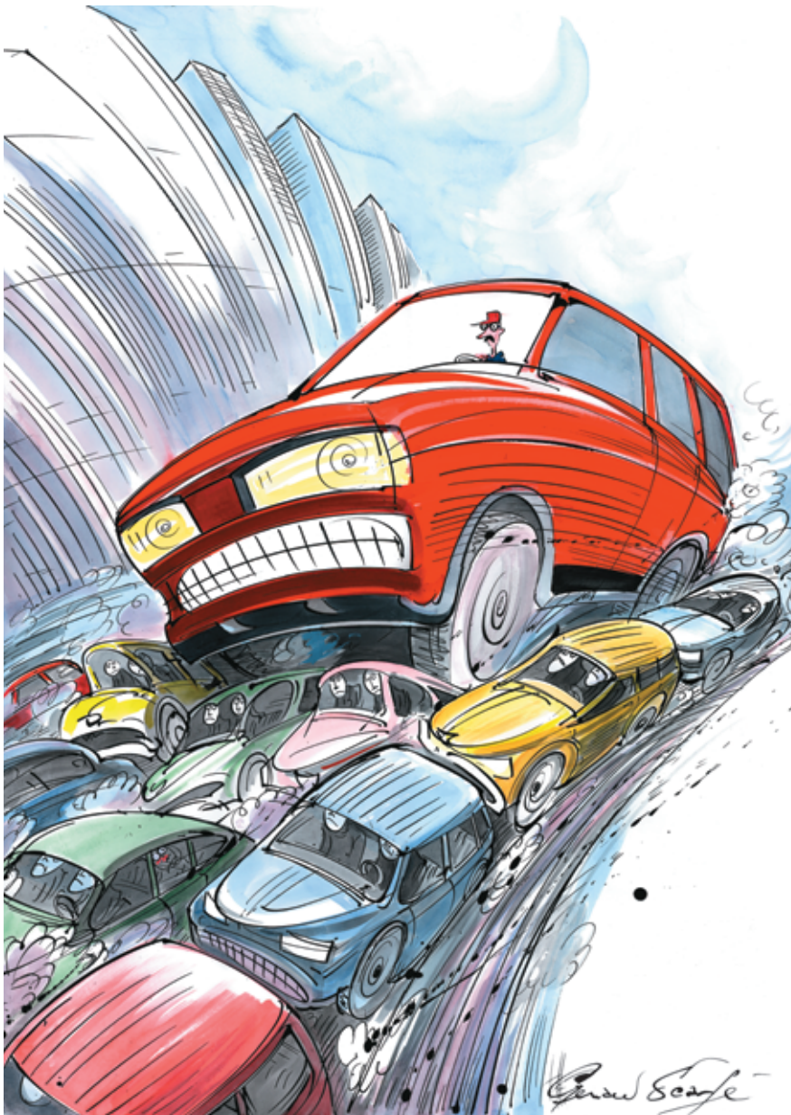
The S.U.V. boom happened when drivers decided to treat accidents as inevitable.